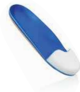
SureFit Custom Tri-Laminate Insert with cork shell, polyurethane layer, blue EVA top cover and transmetatarsal toe filler.