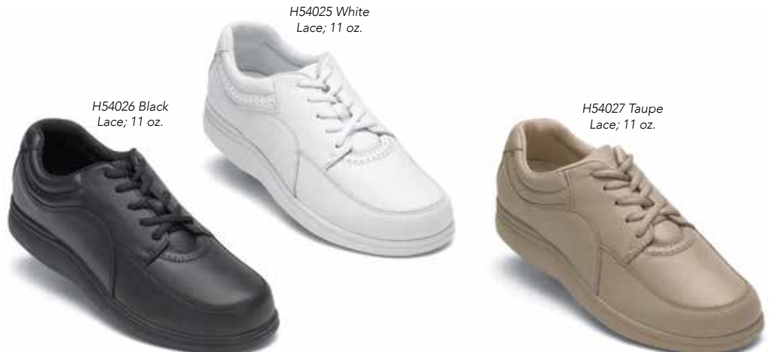
H54026 Black Lace; 11 oz.