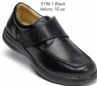
S196-1 Black Velcro; 10 oz.