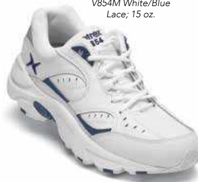
V854M White/Blue Lace; 15 oz.