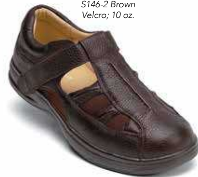
S146-2 Brown Velcro; 10 oz.