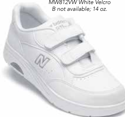
MW812VW White Velcro B not available; 14 oz.