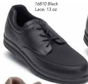
16810 Black Lace; 13 oz.