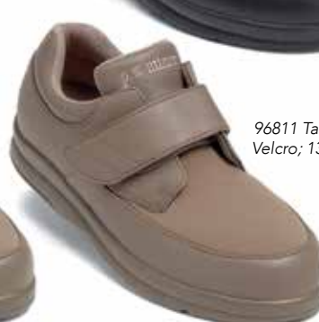
96811 Taupe Velcro; 13 oz.