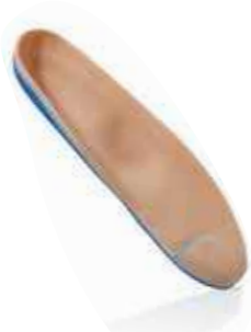
SureFit Custom Tri-Laminate Insert composed of cork shell, polyurethane layer and flesh-tone Plastazote Cover with hallux toe filler and Charcot relief.