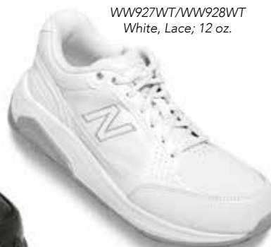
WW927WT/WW928WT White, Lace; 12 oz.