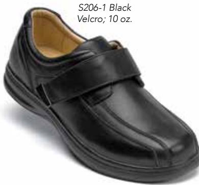
S206-1 Black Velcro; 10 oz.