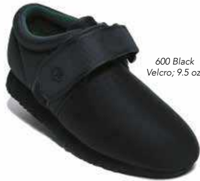
600 Black Velcro; 9.5 oz.