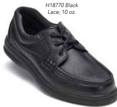
H18770 Black Lace; 10 oz.