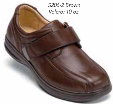
S206-2 Brown Velcro; 10 oz.