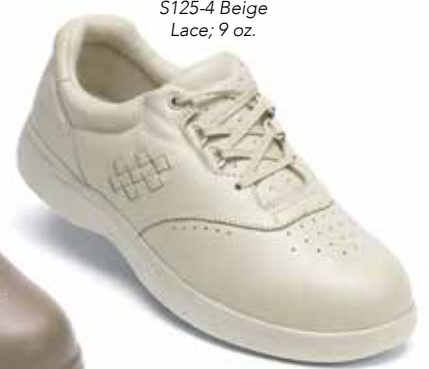
S125-4 Beige Lace; 9 oz.