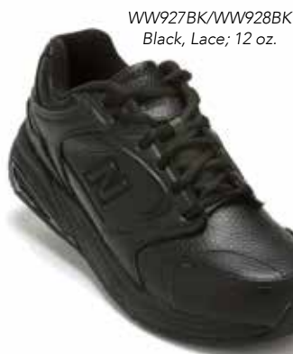
WW927BK/WW928BK Black, Lace; 12 oz.