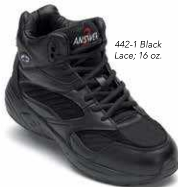
442-1 Black Lace; 16 oz.