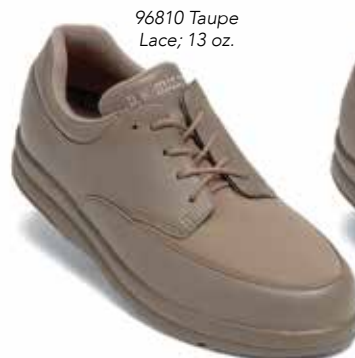
96810 Taupe Lace; 13 oz.