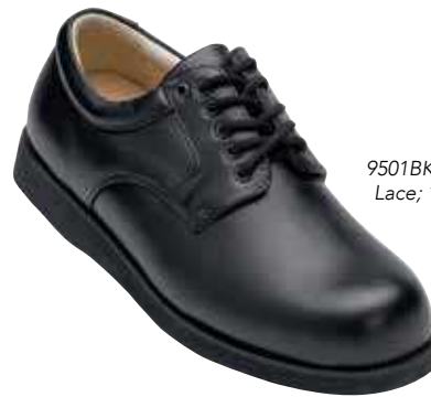
9501BK Black Lace; 14 oz.