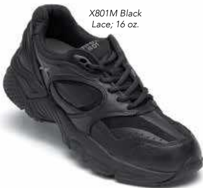
X801M Black Lace; 16 oz.