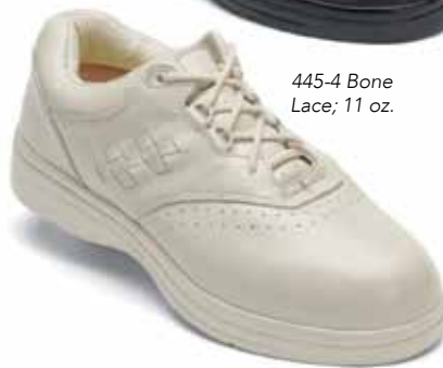
445-4 Bone Lace; 11 oz.