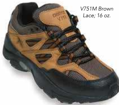
V751M Brown Lace; 16 oz.