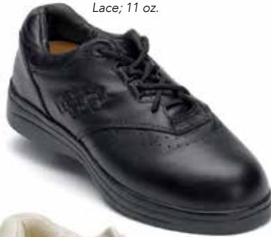
445-1 Black Lace; 11 oz.