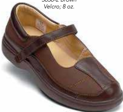
S656-2 Brown Velcro; 8 oz.