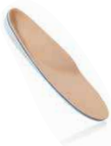
SureFit Custom Tri-Laminate Insert composed of EVA shell, polyurethane layer and flesh-tone Plastazote top cover.