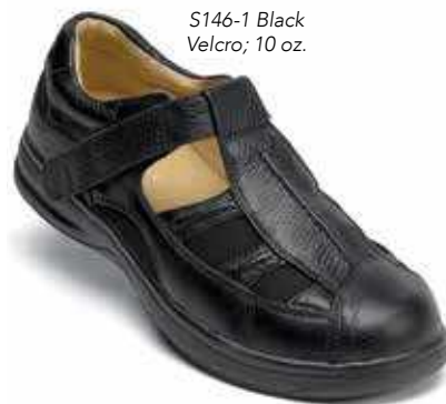
S146-1 Black Velcro; 10 oz.