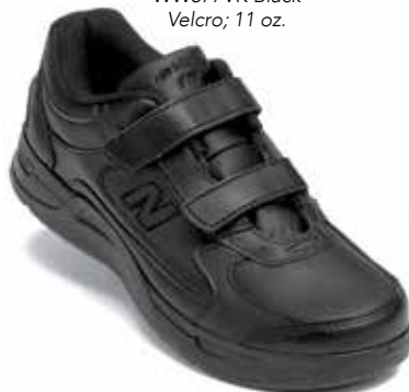
WW577VK Black Velcro; 11 oz.