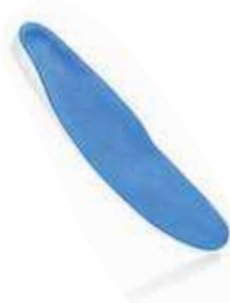
SureFit Custom Bi-Laminate Insert with blue Plastazote top cover, white EVA shell cork lateral wedge and multi-digit toe filler.