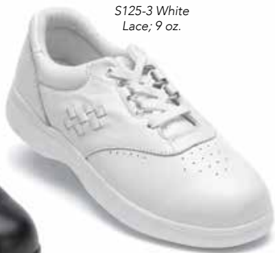
S125-3 White Lace; 9 oz.