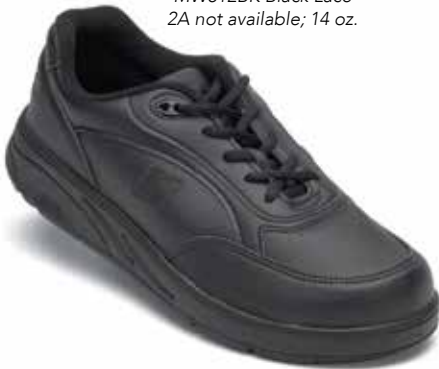
MW812BK Black Lace 2A not available; 14 oz.