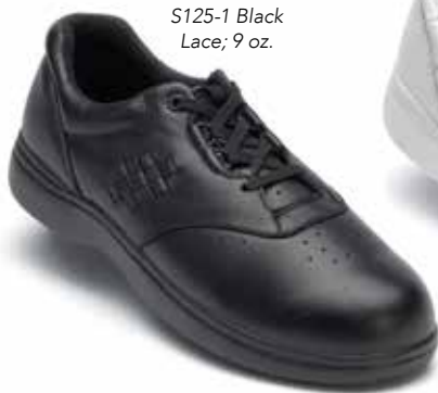
S125-1 Black Lace; 9 oz.