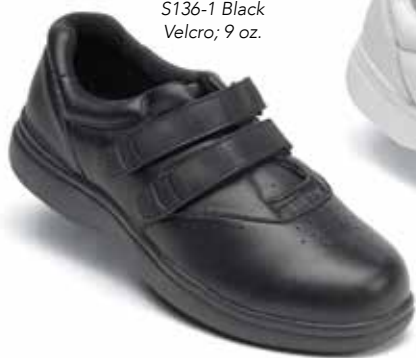
S136-1 Black Velcro; 9 oz.