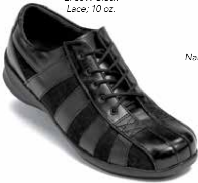
E730W Black Lace; 10 oz.