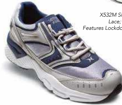
X532M Silver/Navy Lace; 15 oz. Features Lockdown™ Heel Strap