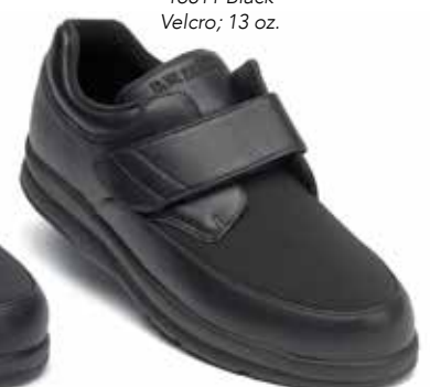
16811 Black Velcro; 13 oz.