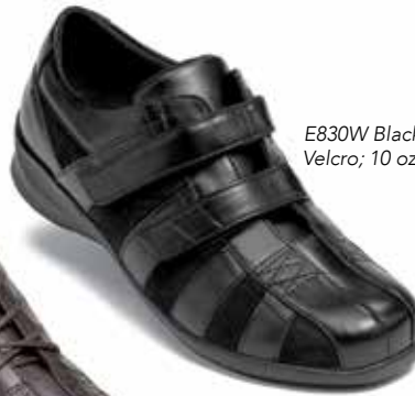
E830W Black Velcro; 10 oz.