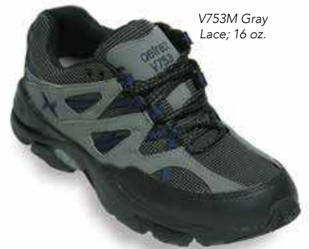
V753M Gray Lace; 16 oz.