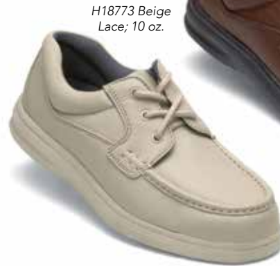
H18773 Beige Lace; 10 oz.