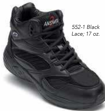
552-1 Black Lace; 17 oz.