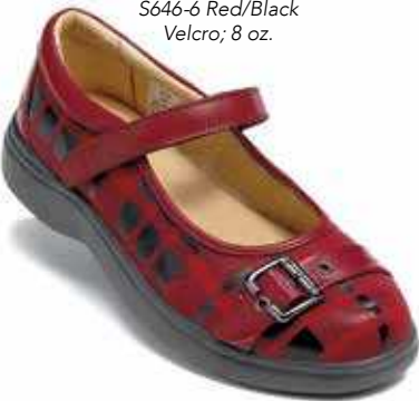
S646-6 Red/Black Velcro; 8 oz.