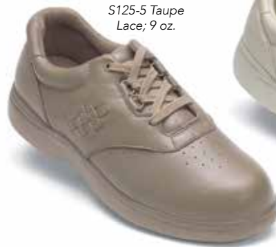
S125-5 Taupe Lace; 9 oz.