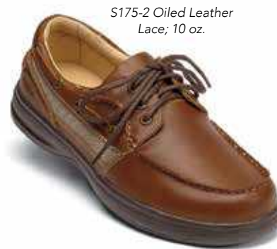
S175-2 Oiled Leather Lace; 10 oz.