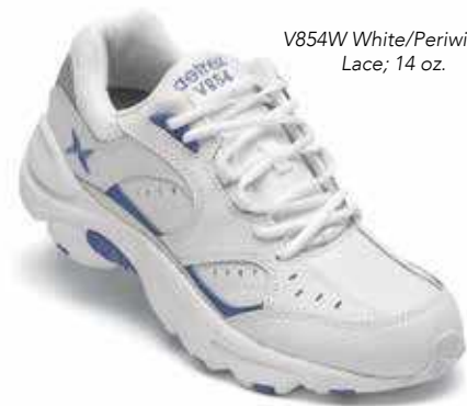
V854W White/Periwinkle Lace; 14 oz.