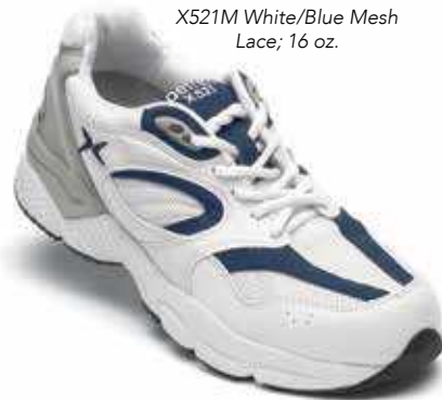
X521M White/Blue Mesh Lace; 16 oz.