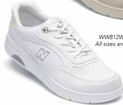
WW812WT White Lace; All sizes and widths; 11 oz.