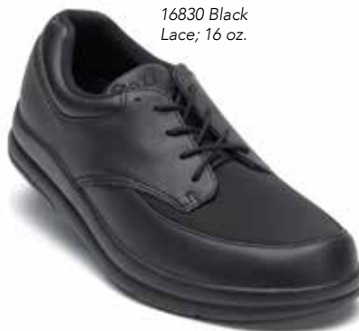
16830 Black Lace; 16 oz.