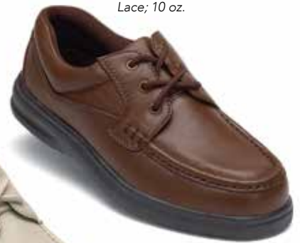
H18772 Brown Lace; 10 oz.