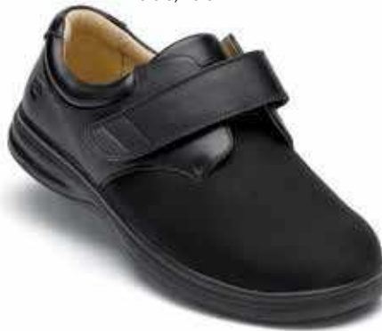
S166-1 Black Velcro; 10 oz.