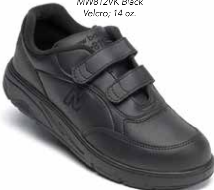
MW812VK Black Velcro; 14 oz.