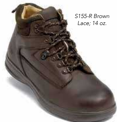
S155-R Brown Lace; 14 oz.