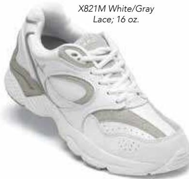
X821M White/Gray Lace; 16 oz.