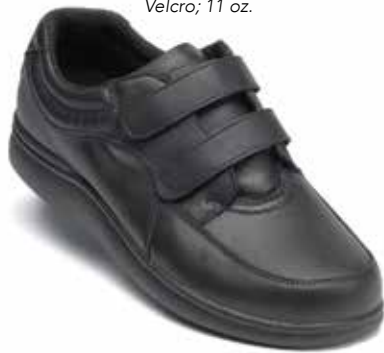
H70294 Black Velcro; 11 oz.