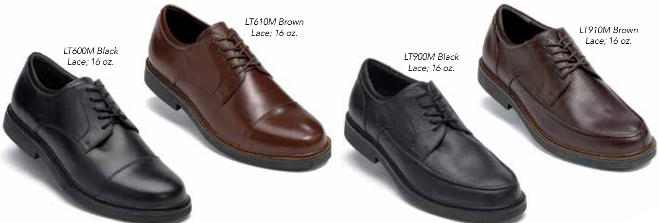
LT600M Black Lace; 16 oz.