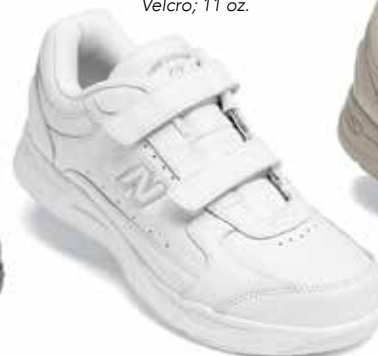
WW577VW White Velcro; 11 oz.