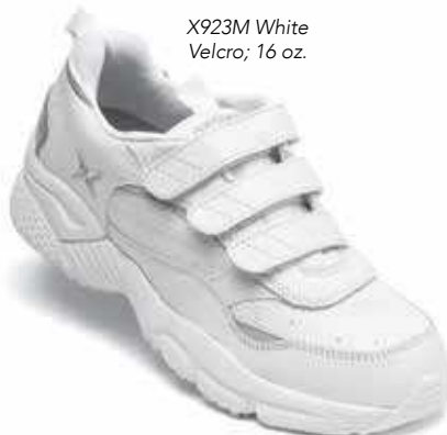
X923M White Velcro; 16 oz.