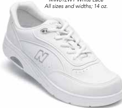
MW812WT White Lace All sizes and widths; 14 oz.