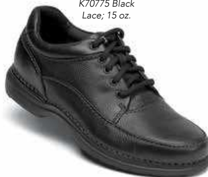
K70775 Black Lace; 15 oz.