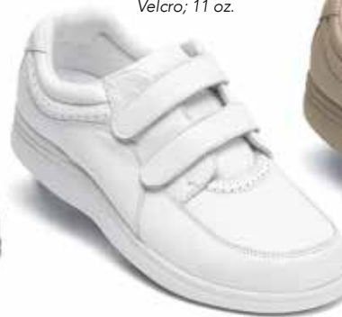
H70293 White Velcro; 11 oz.