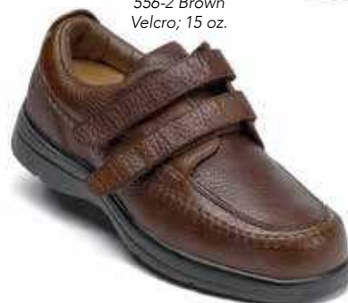
556-2 Brown Velcro; 15 oz.