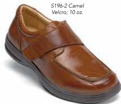
S196-2 Camel Velcro; 10 oz.