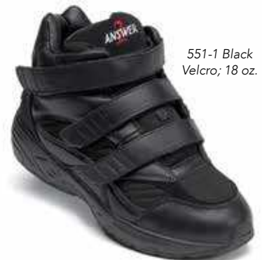
551-1 Black Velcro; 18 oz.