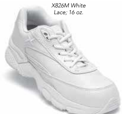
X826M White Lace; 16 oz.