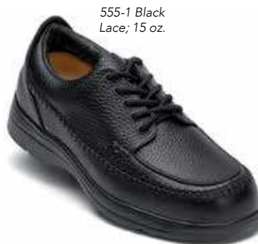
555-1 Black Lace; 15 oz.