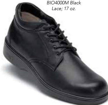
BIO4000M Black Lace; 17 oz.