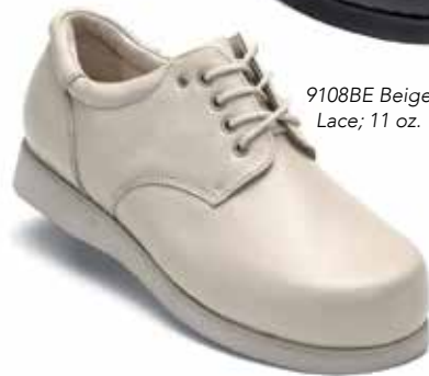
9108BE Beige Lace; 11 oz.