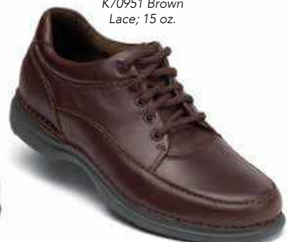
K70951 Brown Lace; 15 oz.