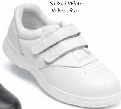
S136-3 White Velcro; 9 oz.