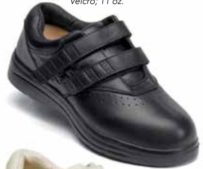
446-1 Black Velcro; 11 oz.