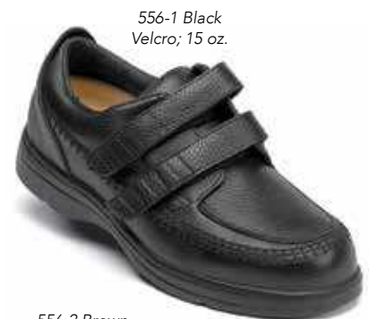
556-1 Black Velcro; 15 oz.