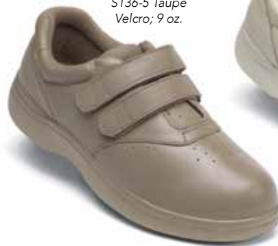
S136-5 Taupe Velcro; 9 oz.