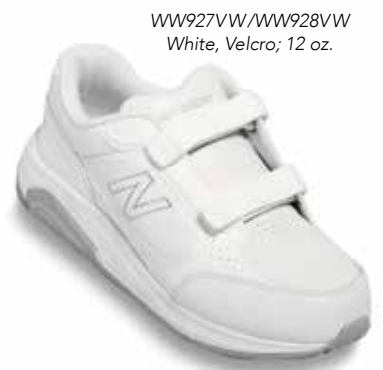
WW927VW/WW928VW White, Velcro; 12 oz.