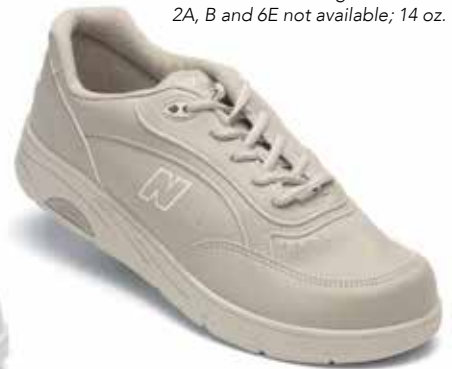
MW812BE Beige Lace 2A, B and 6E not available; 14 oz.