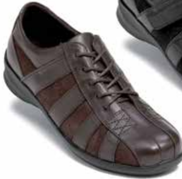
E731W Brown Lace; Narrow not available; 10 oz.