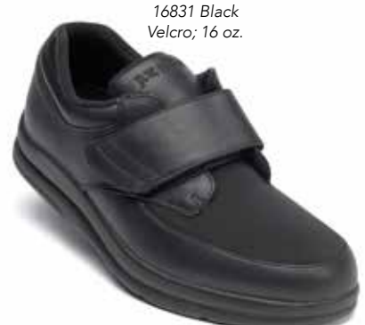
16831 Black Velcro; 16 oz.