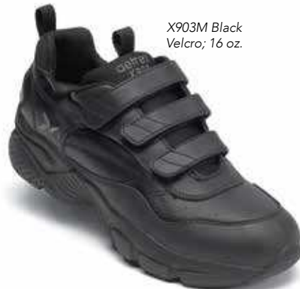
X903M Black Velcro; 16 oz.