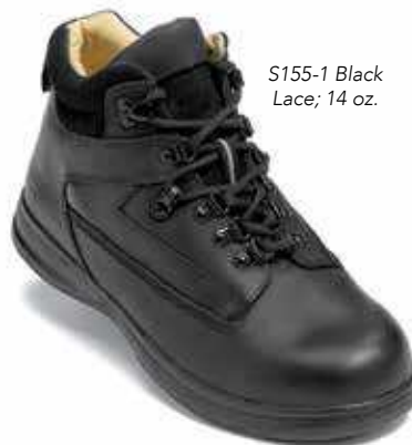
S155-1 Black Lace; 14 oz.