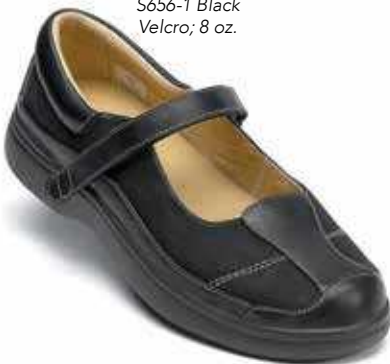
S656-1 Black Velcro; 8 oz.