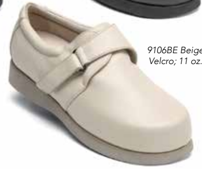
9106BE Beige Velcro; 11 oz.