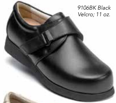
9106BK Black Velcro; 11 oz.