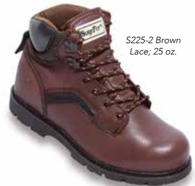
S225-2 Brown Lace; 25 oz.