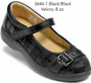
S646-1 Black/Black Velcro; 8 oz.