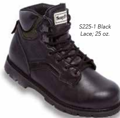
S225-1 Black Lace; 25 oz.