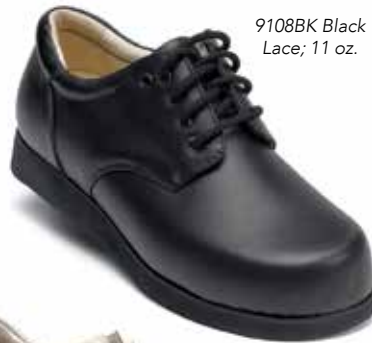
9108BK Black Lace; 11 oz.