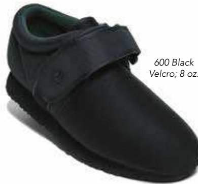
600 Black Velcro; 8 oz.