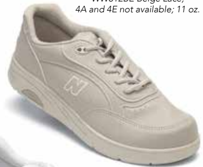
WW812BE Beige Lace; 4A and 4E not available; 11 oz.