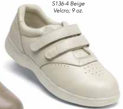
S136-4 Beige Velcro; 9 oz.