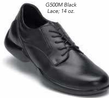
G500M Black Lace; 14 oz.