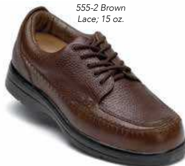
555-2 Brown Lace; 15 oz.